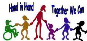
Ober Park Playground FY14 Ribbon Cutting